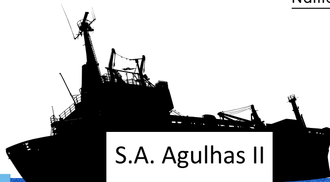
S.A. Agulhas II