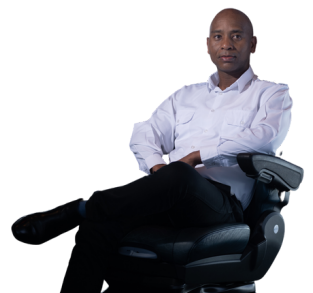
Captain Knowledge Bengu