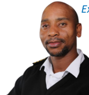
Cap. Knowledge Bengu Captain